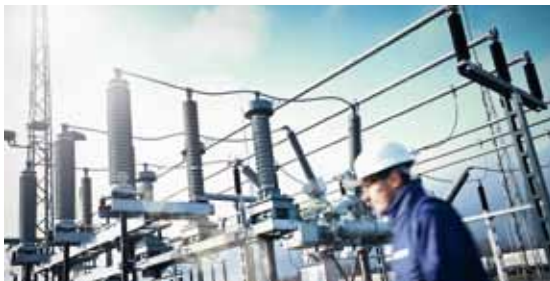
Supplying energy and media is just one aspect of a comprehensive site management concept

We have access to the qualified specialists deployed by FMS Facharbeiter und Montage-service GmbH and IPS Industrial Plant Services GmbH so we can react flexibly and provide a consistently high level of service during peak periods, e.g. during shutdowns