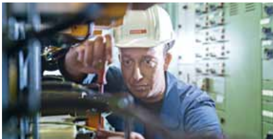
We install, check, service and repair complex electrical and instrumentation technology

XERVON always takes the whole picture into account when it comes to maintenance work. Its portfolio, therefore, also includes additional related services. Thus, for example, we also manage infrastructure facilities such as fire detection