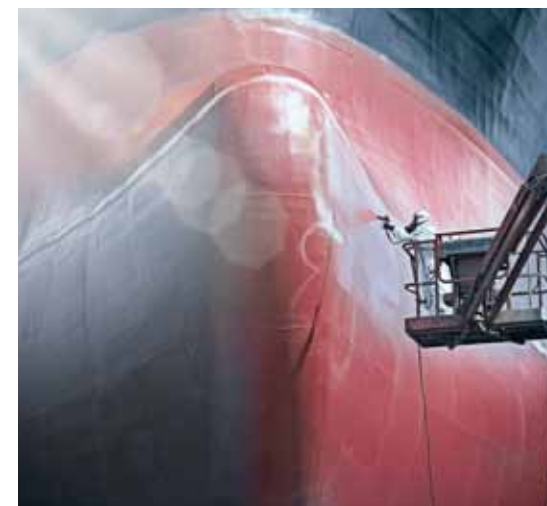
XERVON has been carrying out blasting and coating work for shipyards on a regular basis for decades now

Our independent company, XERVON Plastacor GmbH, is responsible for marketing Plastacor® and carrying out the coating work on the different plant components